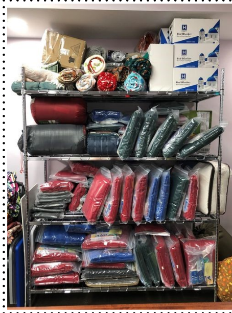
Sleeping Bag and Blanket Donations